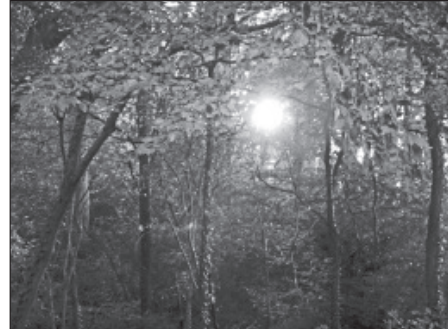
Sun Through Cypress Bog

The color of the sky faded against the backdrop of bare maple trees as the last rays of sunlight tucked into ribbons of dray grass, fringed with the sound of cricket song, frequent and full. The melody was constant like the coming of evening and wildflowers, thick in the fields, swayed and bowed in the wind as if to sense the implication of the cricket song. Stars, bright as jasmine, dominated the sky and a chorus of crickets sang in unity, but the fullness of evening quieted the voices of song. Yet, the spirit of a choir of crickets, deemed worthy to be heard, filled my thoughts again and again as evening sank into the silence of autumn.